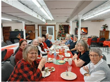
Community Christmas Dinner 2024 Beachburg, ON

This is just a few of the pictures. More can be seen on our Facebook page – National United Church Women.