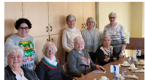
Mount Royal Emmanuel UCW Advent Lunch Saskatoon, SK