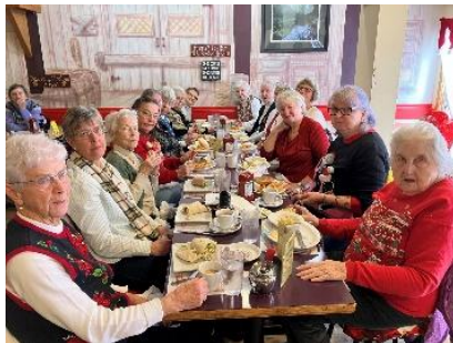
Trinity St Stephen's UC Amherst, NS