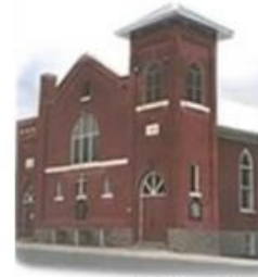
Trinity United Church Hastings, ON