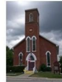
St. Paul's United Church Warkworth, ON