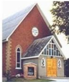
Roseneath United Church Roseneath, ON